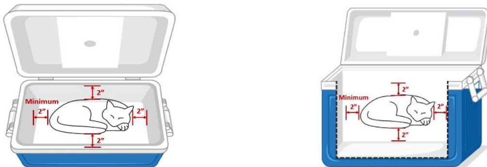
Minimum 2" of dry ice on all sides between pet and cooler wall

Important — body position: Pets should never be rewarmed after freezing. The position the animal is in when frozen is the position it will be shipped in. Make sure there is adequate cooler clearance in that position.