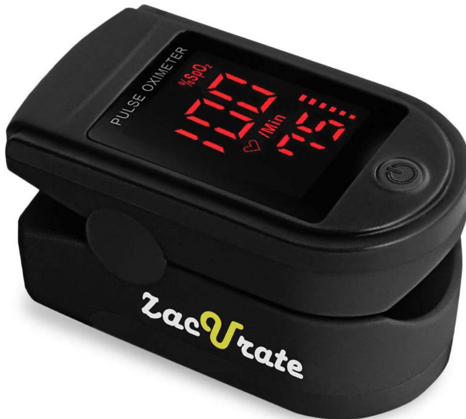
Figure 14-3. A pulse oximeter opens on a spring-loaded hinge so that it can accept a finger tip to assess oxygenation of the blood.

A pulse oximeter displays the percentage of arterial hemoglobin in the blood. Normal saturation readings at or near sea level range between 95% to 100%. A lower reading is acceptable at significantly higher altitude, such as 5,000 feet or above.