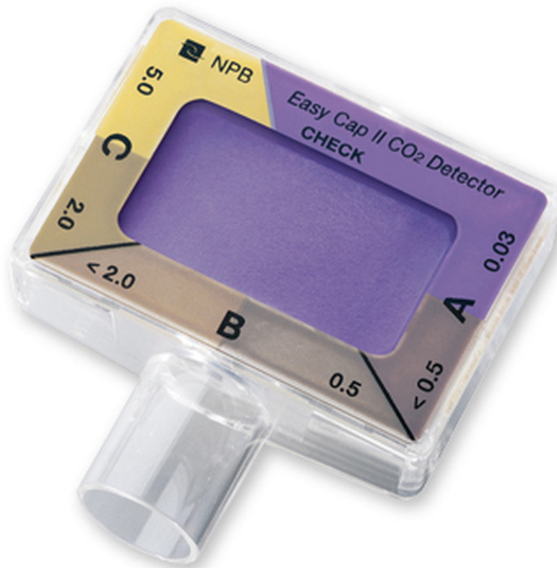
Figure 14-4 Easy Cap disposable ETCO 2 detector, which changes color to provide an approximate indication of the partial pressure of carbon dioxide gas at the end of each exhalation.

In 2006 this situation changed when Alcor started using the CO 2 SMO (pronounced “cosmo”), a sophisticated monitoring device that can give a complete respiratory profile of the patient. The CO 2 SMO does capnography, pulse oximetry, and gives a comprehensive non-invasive, continuous respiratory profile. It operates by connecting a respiratory sensor to the patient's ventilation circuit while also connecting the pulse oximeter sensor to a finger or earlobe. See Figure 14-5.