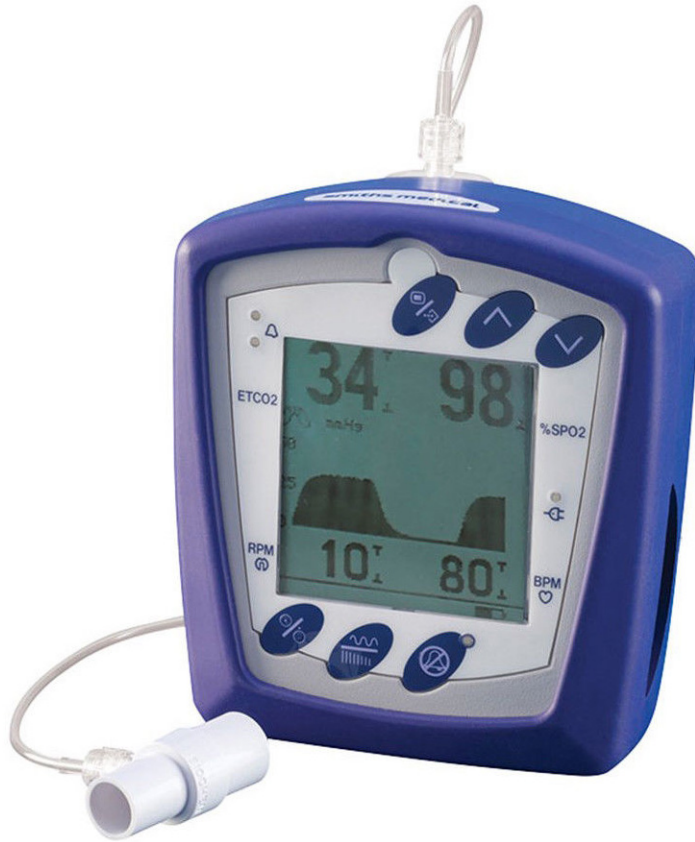
Figure 14-6. The Capnocheck II.

ETCO 2 can be used to evaluate the effectiveness of chest compressions and as a predictor of outcome during cardiopulmonary resuscitation. Studies have found that patients with restoration of spontaneous circulation (ROSC) have higher ETCO 2 levels than patients that could not be resuscitated (levels <10 mmHg). Normal ETCO 2 levels are between 35 and 45 mmHg. Because numeric readings of ETCO 2 have rarely been obtained and analyzed in cryonics, and knowledge about what ETCO 2 levels to expect and not to expect are currently unknown. At this point in time, meticulous note taking of ETCO 2 levels during CPS is essential to generate more data about the efficacy of cardiopulmonary support.