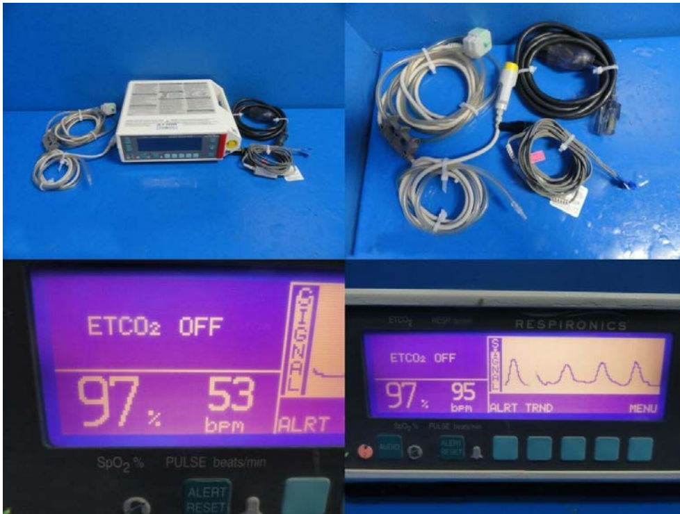
Figure 14-5. The CO2SMO system, showing the unit, its display, and associated cabling.

Although this represents the state of the art in respiratory monitoring, its cost, size, and complexity will limit routine use of this equipment in remote cases.