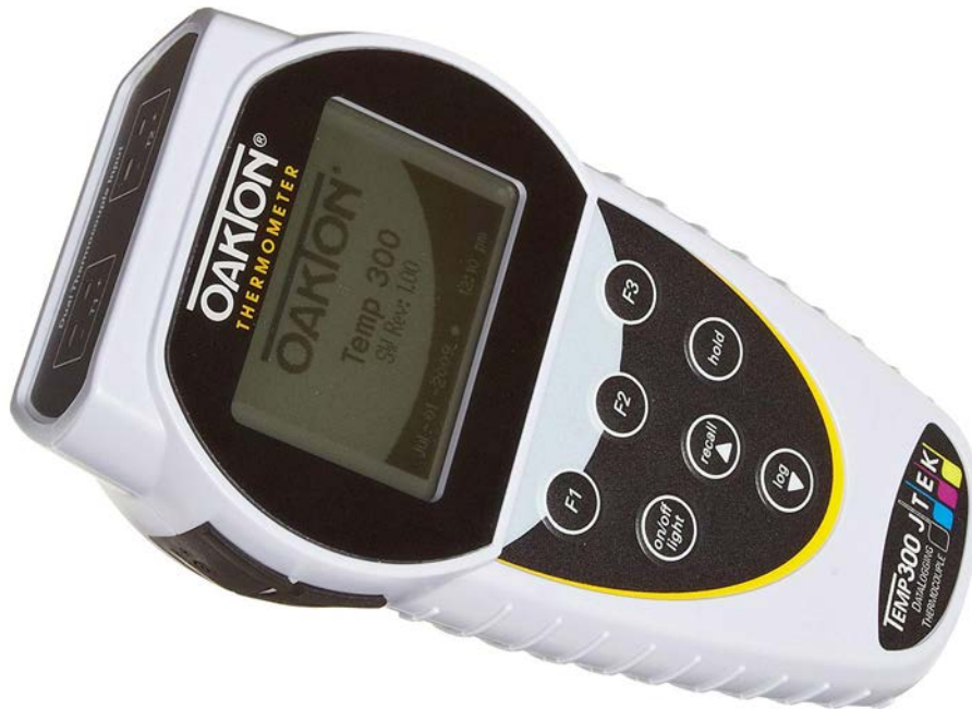
Figure 14-1. The Oakton Temp-300 Dual-Input Datalogging Thermocouple Thermometer.

These devices not only permit time-stamped temperature logging of two temperature probes but also have the ability to change the logging interval, so they can be used in situations where the logging interval needs to be relaxed to prevent running into the maximum number of data points, such as during transport of the patient.